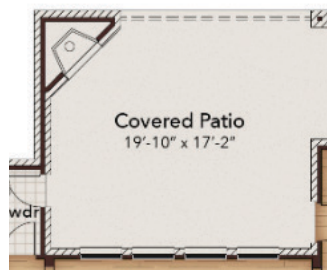
Opt. Outdoor Fireplace