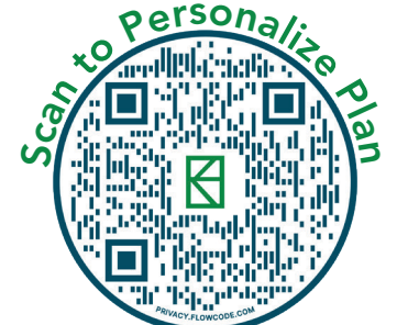
Interactive Floor Plan & Exteriors