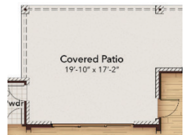
Opt. Sliding Glass Door