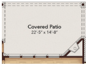
Opt. Outdoor Fireplace