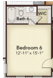
Opt. Bed 6 / Bath 6