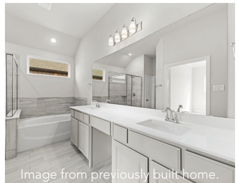
Image from previously built home.