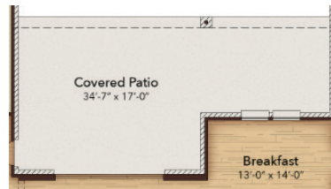
Opt. Sliding Glass Door