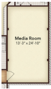
Opt. Media Room