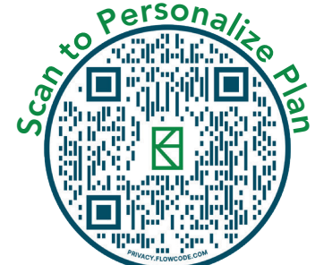
Interactive Floor Plan & Exteriors