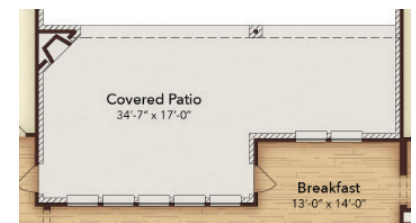
Opt. Outdoor Fireplace