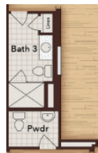
Opt. Linear Fireplace