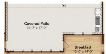
Opt. Outdoor Kitchen