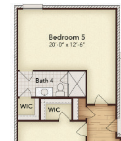
Opt. Bedroom 5/ Bath 4 ILO Flex Room