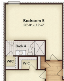
Opt. Bedroom 5/ Bath 4 ILO Flex Room