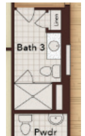
Opt. Linear Fireplace