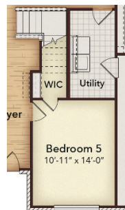
Opt. Bed 5