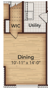
Opt. Dining Room