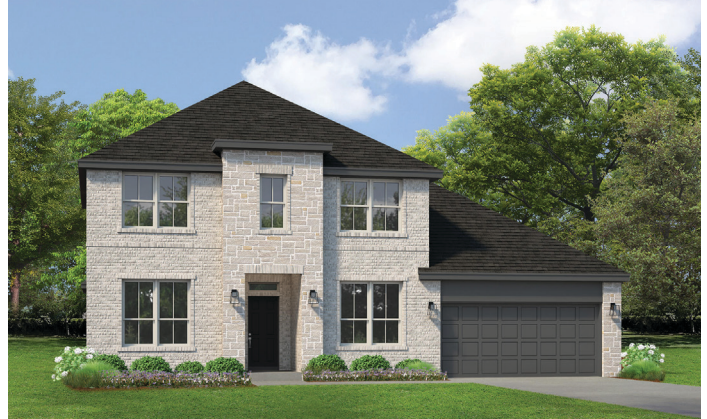
ELEVATION A STONE