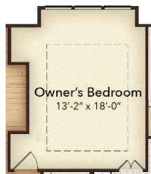
Opt. Sitting Area @ Owner's Suite