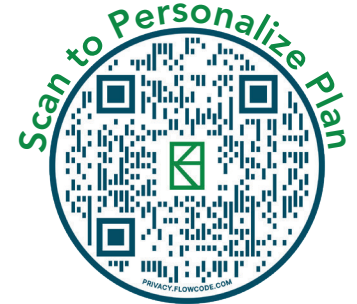
Interactive Floor Plan & Exteriors