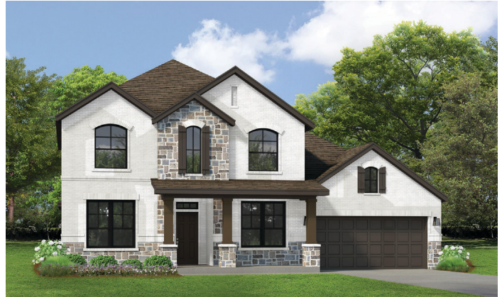
ELEVATION C STONE

*These renderings are an artist's interpretation, actual colors and selections may vary. Some elements shown in renderings display optional upgrades.