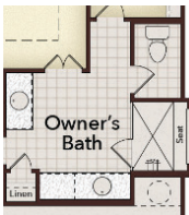
Opt. Alternate Owner's Bath