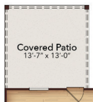
Opt. Covered Patio 1