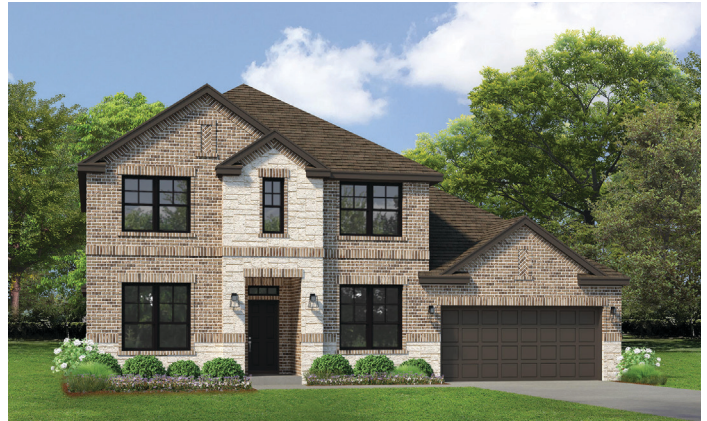
ELEVATION B STONE