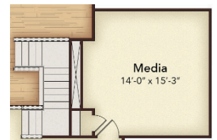
Opt. Media Room @ Upstairs