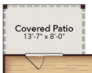
Opt. Twin Doors