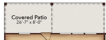
Opt. Extended Covered Patio 2