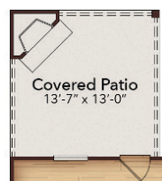
Opt. Covered Patio 1 with Fireplace