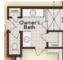
Opt. Alternate Owner's Bath