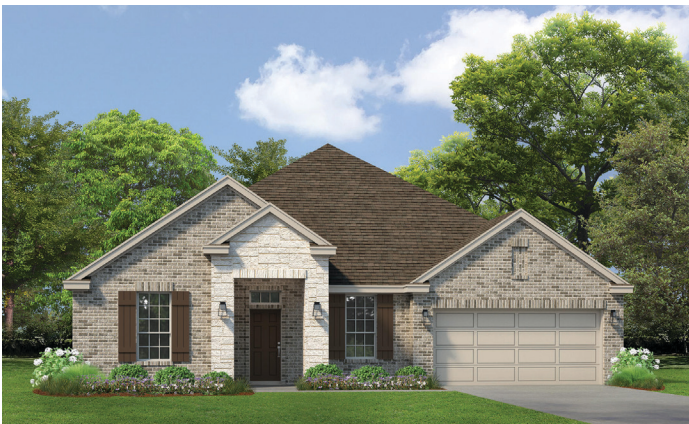
ELEVATION B STONE