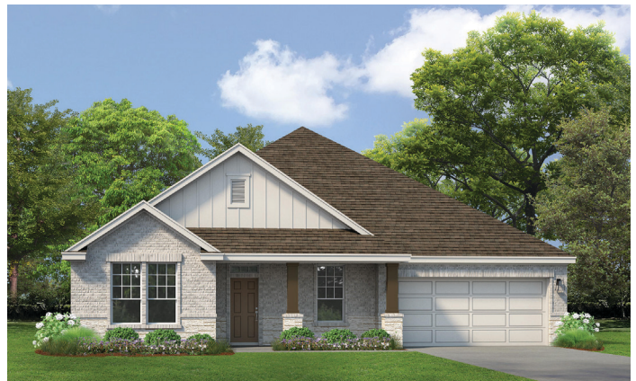
ELEVATION C STONE