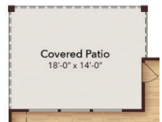
Opt. Extended Covered Patio