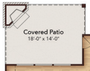
Opt. Extended Covered Patio with Fireplace