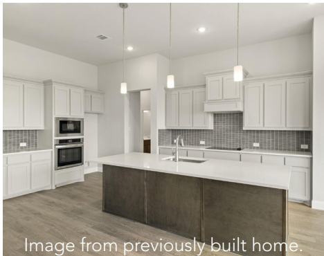
Image from previously built home.