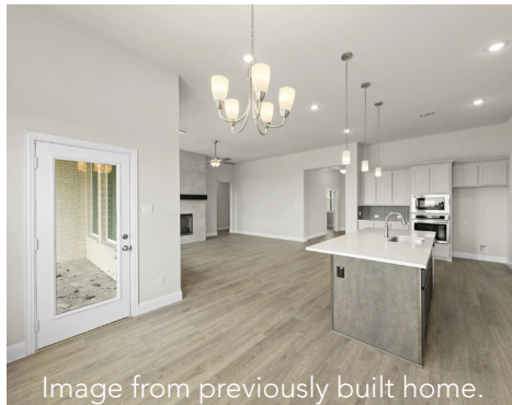
Image from previously built home.