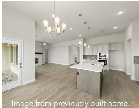
Image from previously built home.