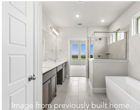
Image from previously built home.